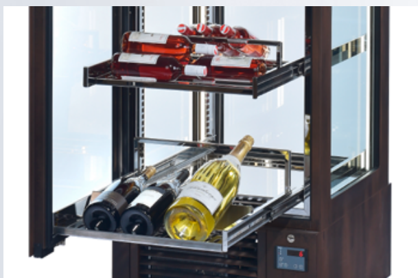
HZ 1 and HZ 2 support system with full extension drawer. Combination with magnum holder + bracket for individual inclined position.