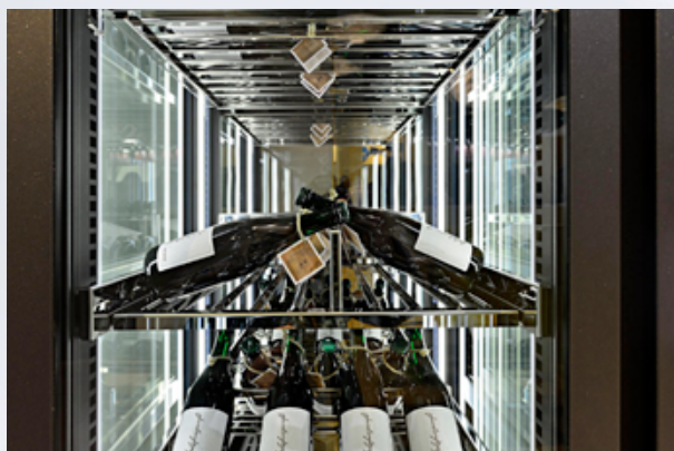
A support system that can be mounted and turned by 90° ensures a perfect all-round presentation.