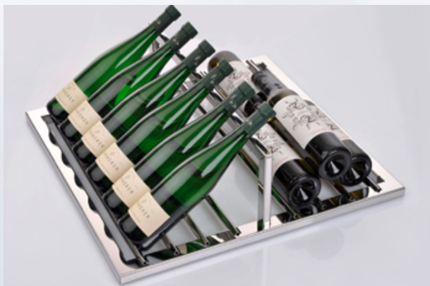
HZ 2 support system with adjustable bracket at the front and back for optimum presentation of small and large bottles.

Our refrigerated wine cabinets impress with a very successful design and prevail with functional highlights: maximum capacity, perfect storage conditions, optimum presentation, adaptable for different bottle sizes, and it is easy to reach the individual bottles thanks to an optional full extension drawer for the individual supports – you can expect all of this of our refrigerated wine cabinets.