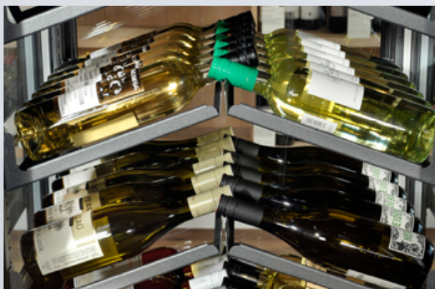
Maxi support system