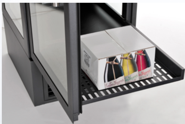
A configuration with full extension drawers is optionally also possible only on the top or bottom.